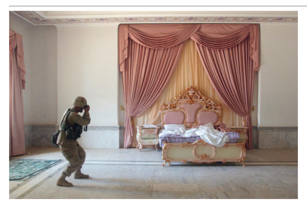
2.Saddam Husein's Presidential Palace.