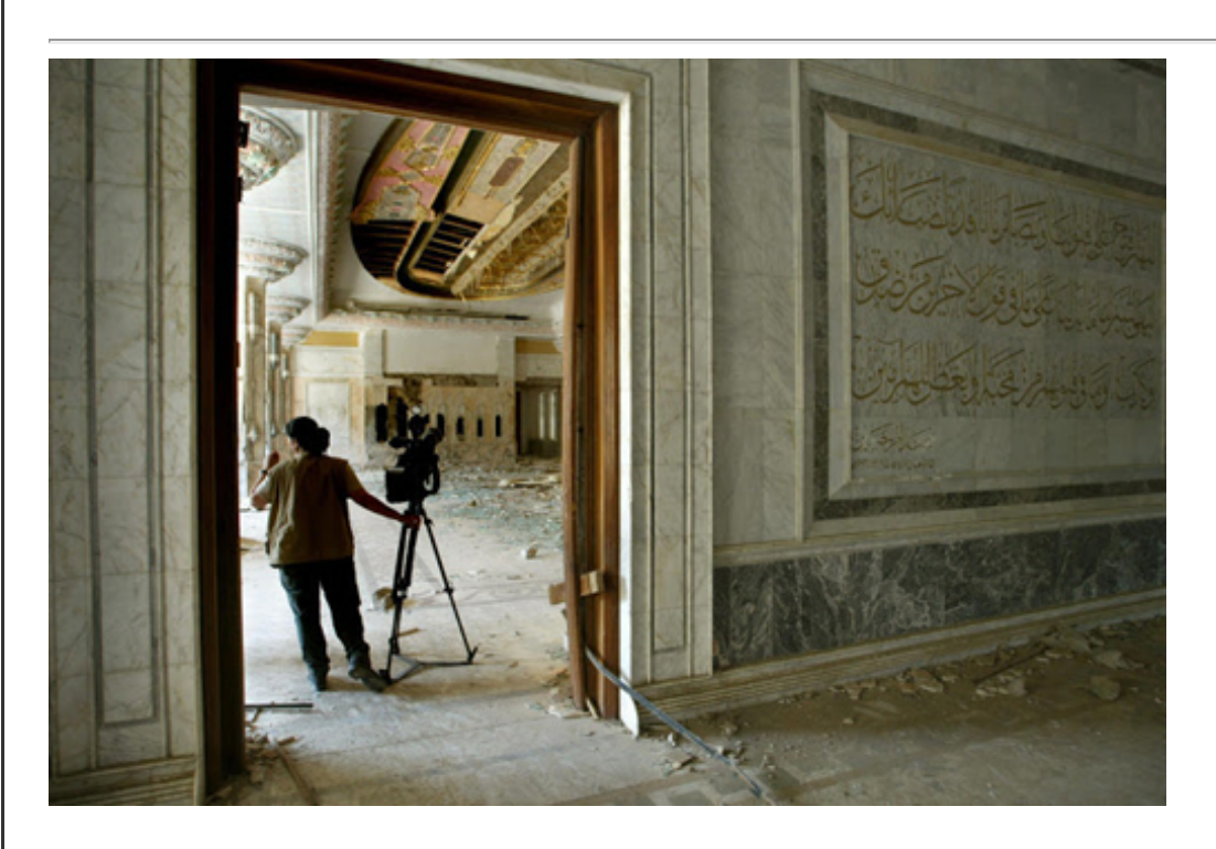
6. Radwaniya palace, Baghdad.