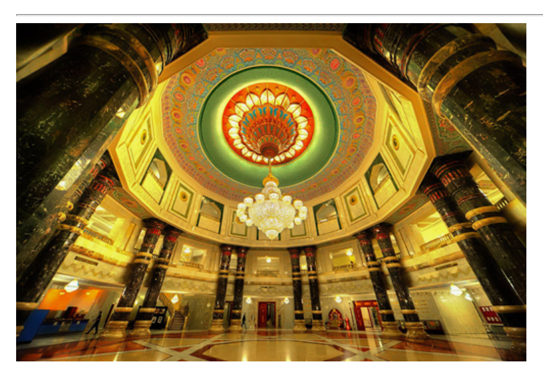
4. Eyes catching hall of al Faw palace.