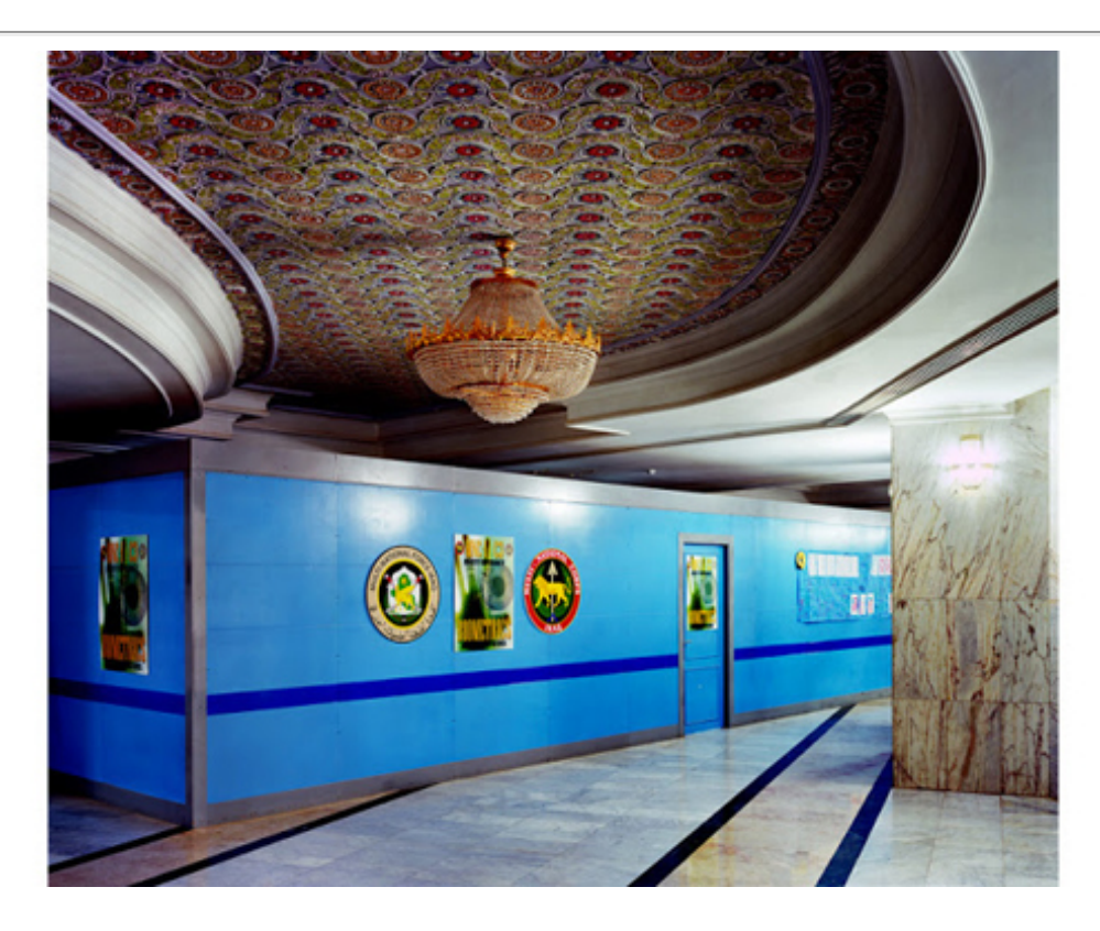
8. \\ Mindblowing interior of the corridor area of Palace.