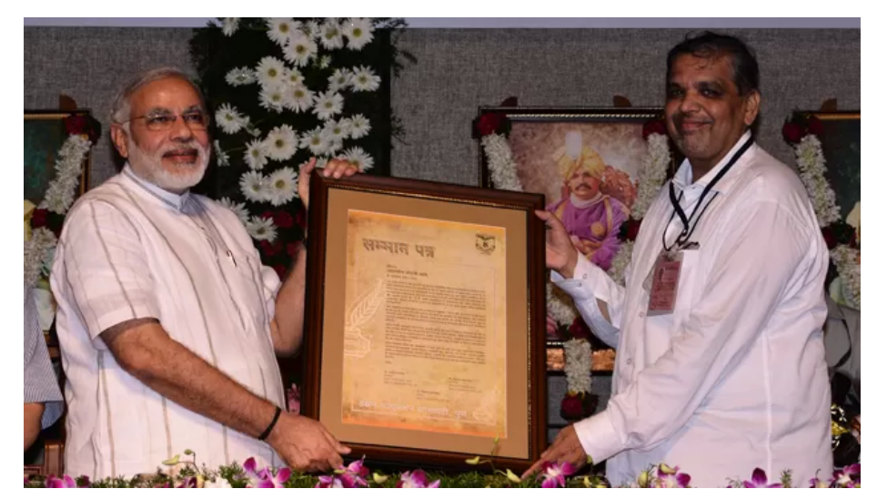
7/14/13 From a man-making mission, education has now become a moneymaking machine, which is unfortunate: Shri Modi speaks at Fergusson College « Hom... the occasion.